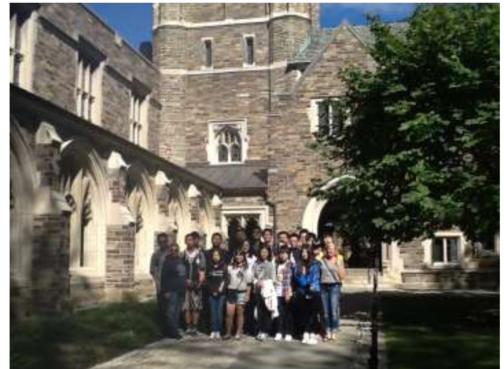
A group of students visiting Princeton University. This college "road trip" weekend also included a stop at Villanova University.