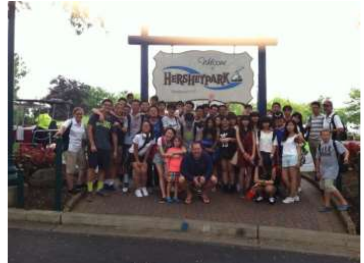
Residential Students on a weekend getaway to Hershey Park, an amusement park located in Hershey, Pennsylvania.

Meals are provided for all boarding students. Boarding students eat meals together in our Dining Hall. We accommodate a wide range of dietary needs and requirements, and we also provide opportunities for our boarding students to dine out occasionally as part of regularly scheduled social activities.